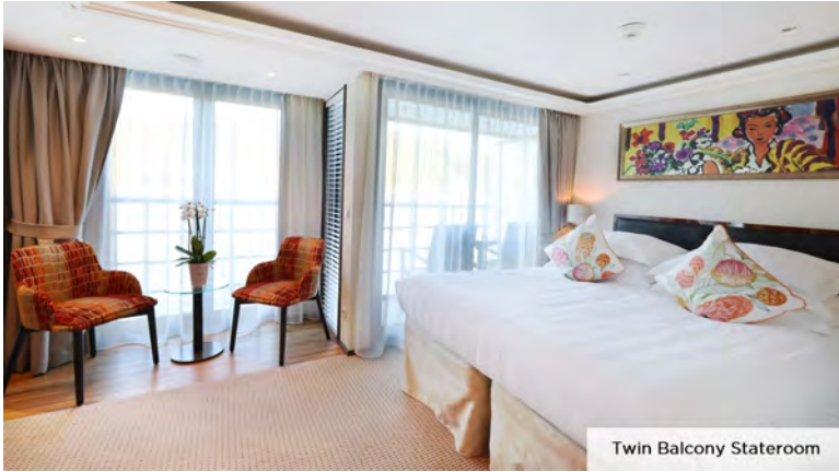
Twin Balcony Stateroom

7-night cruise | June 16-23, 2025 | Aboard AmaVerde